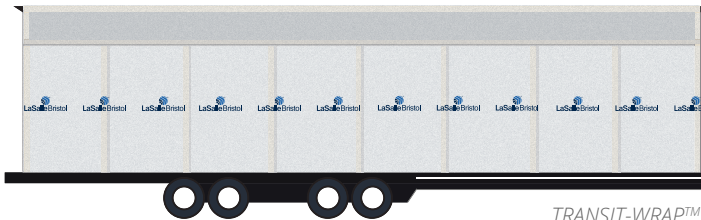
68" WIDE MAX PRINT CAPABILITY