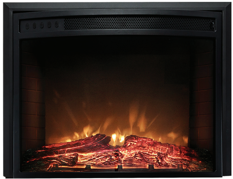
model shown 62-0539 PD2616F